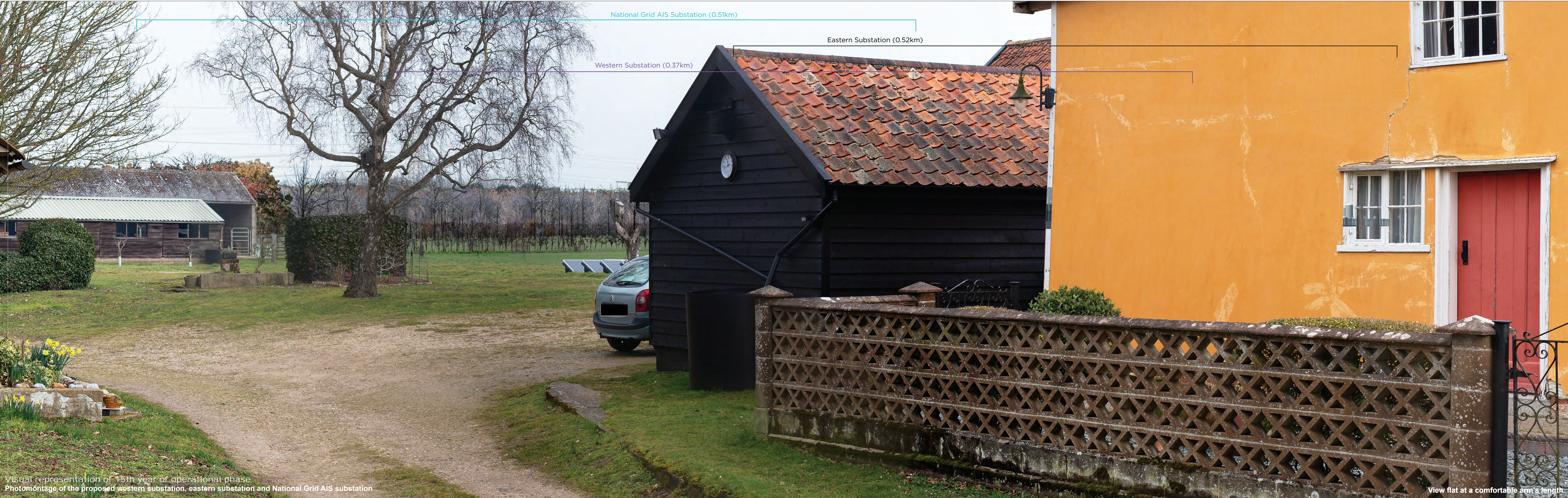
Visual representation of 15th year of operational phase Photomontage of the proposed western substation, eastern substation and National Grid AIS substation