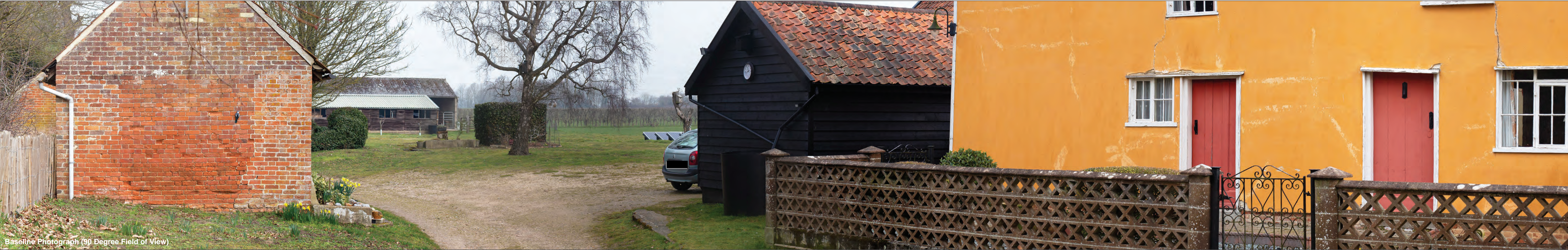
Baseline Photograph (90 Degree Field of View)