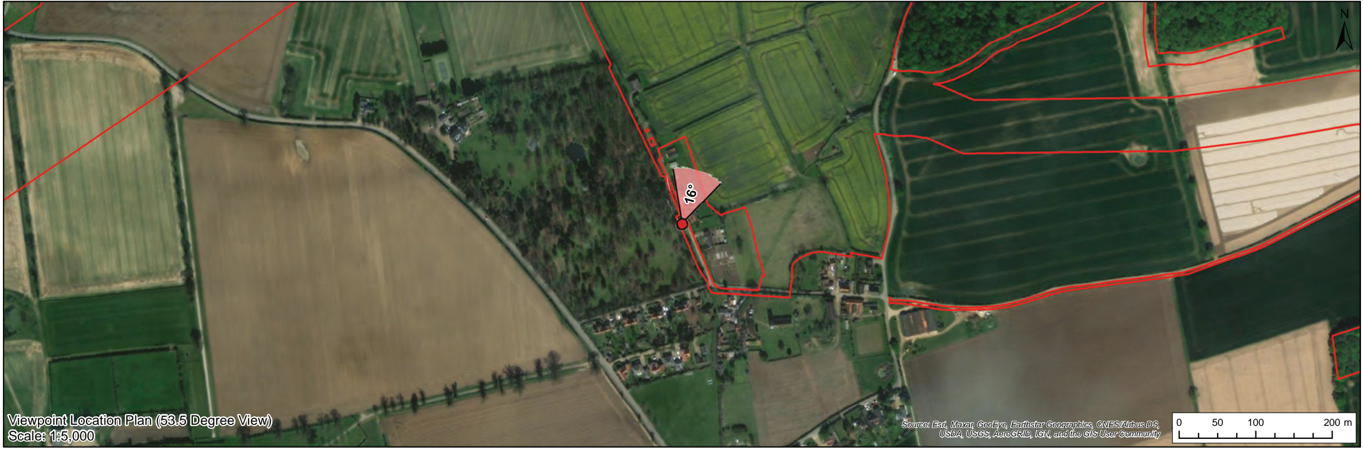
Viewpoint Location Plan (53.5 Degree View) Scale: 1:5,000